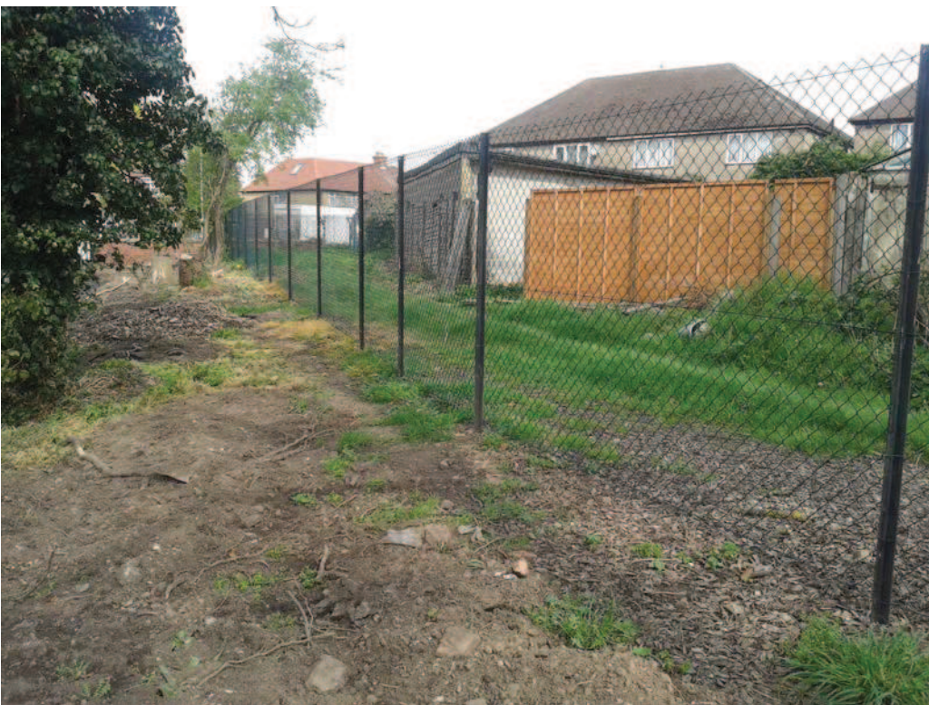
New fencing installed