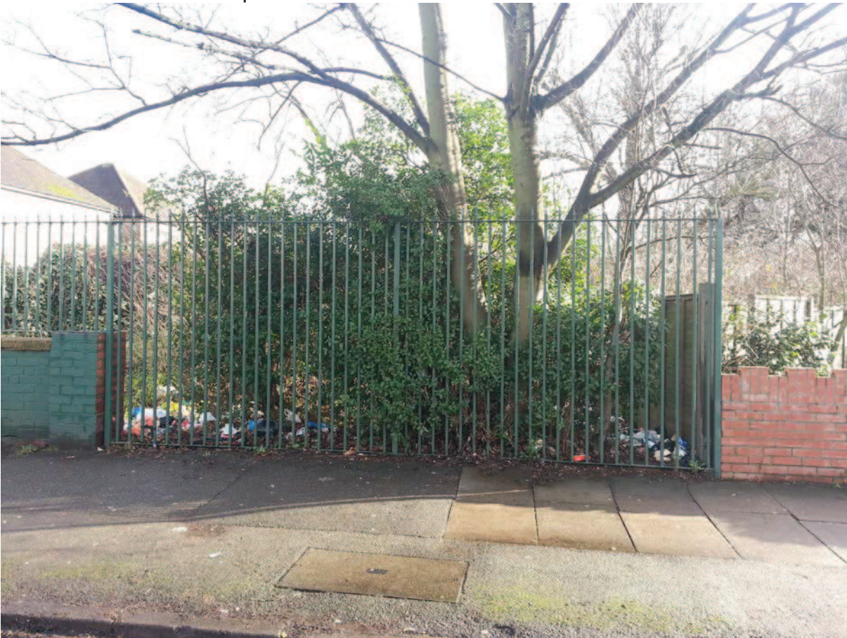
Area as it was before improvements