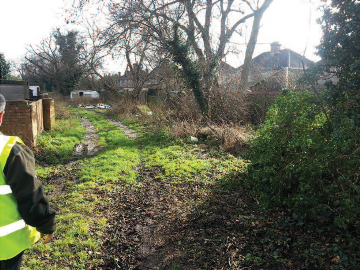
Area as it was before improvements