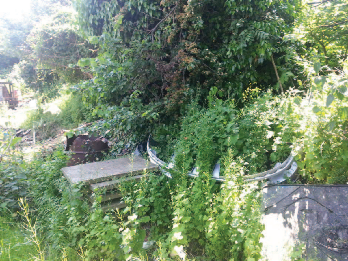
Area as it was before improvements