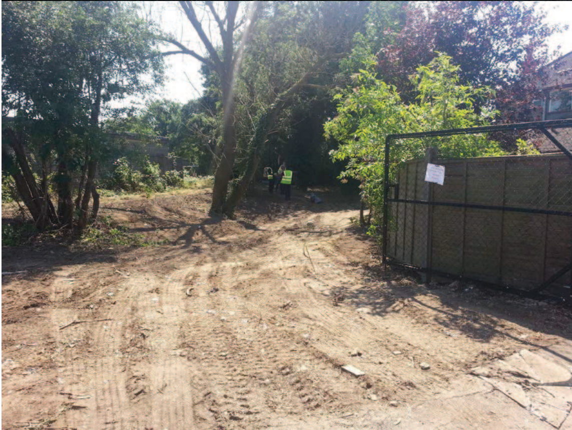
Area after site clearance