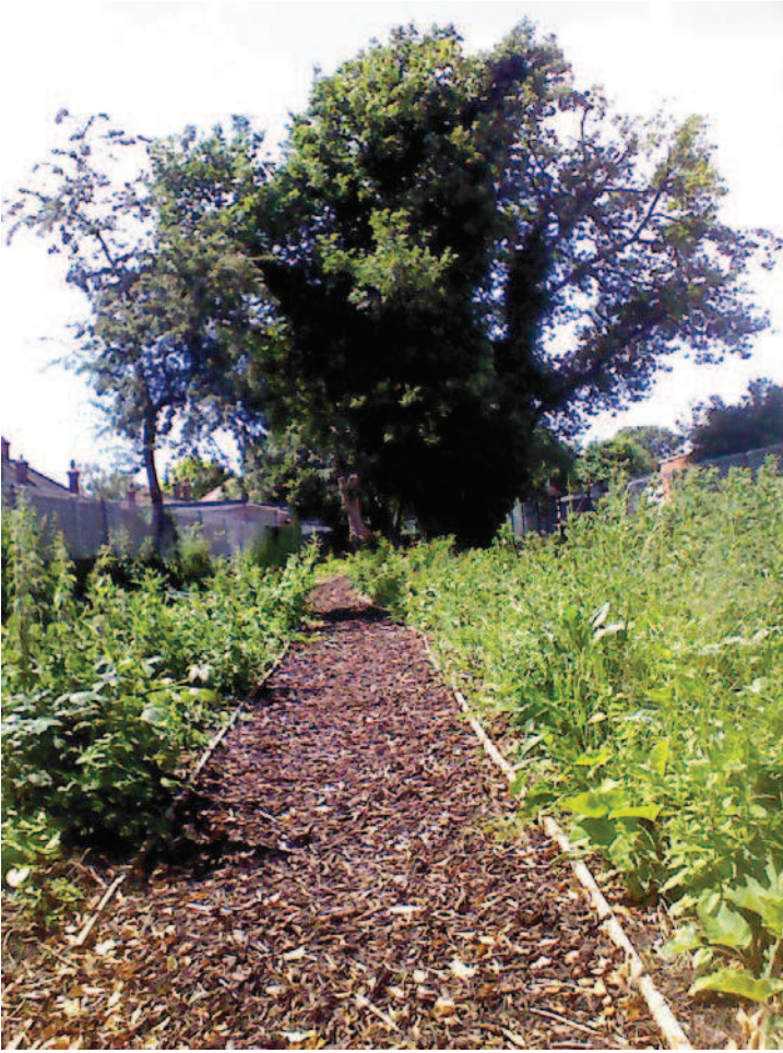
Finished footpath with wild flower mix (Poppy and Golden Coreopsis)