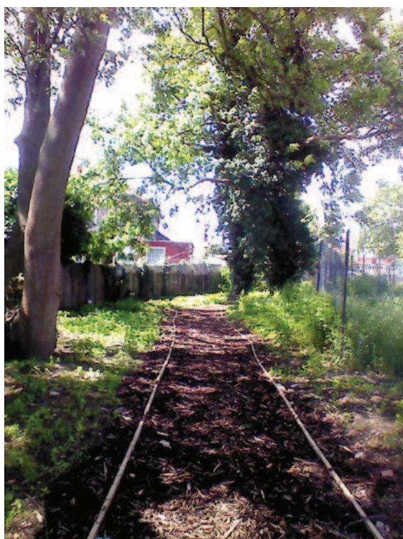
Finished footpath with wild flower mix (Poppy and Golden Coreopsis)