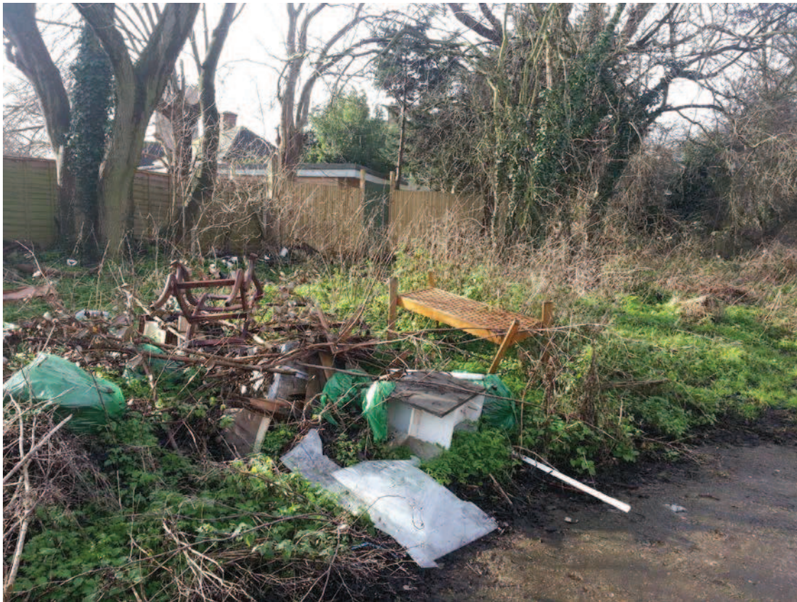
Area as it was before improvements