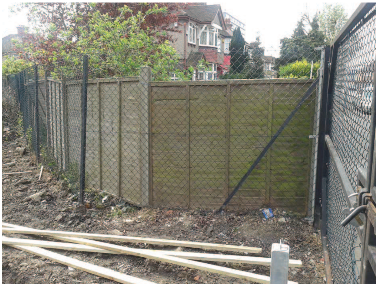
New fencing installed